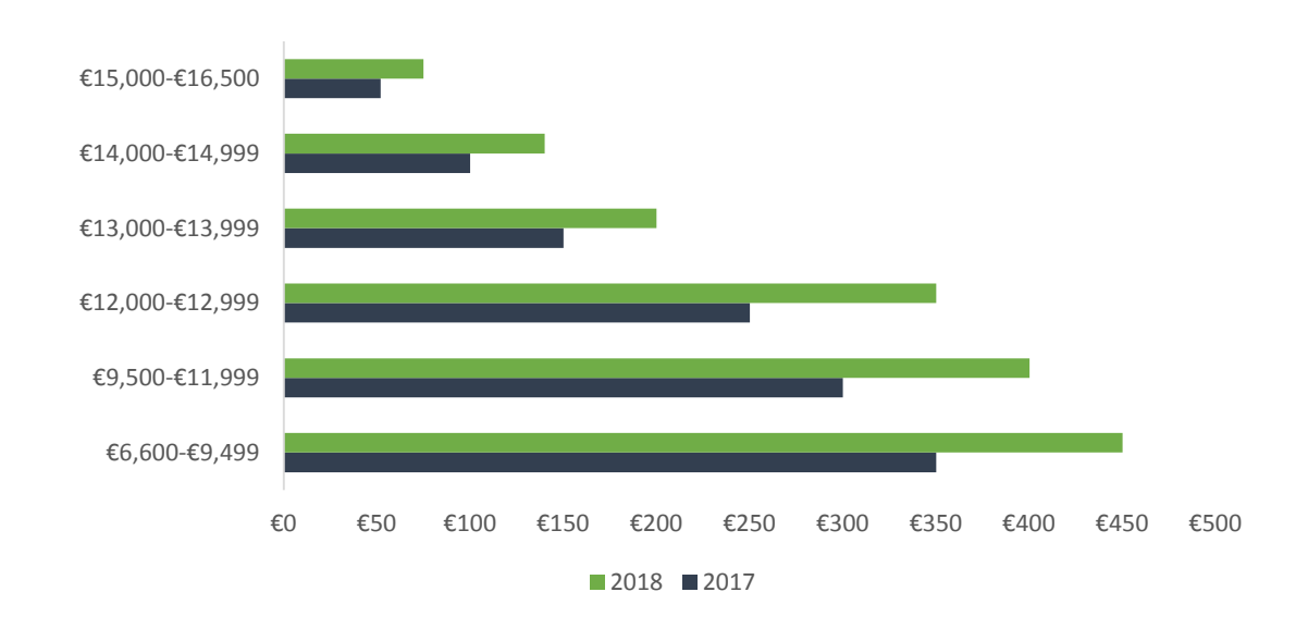
Figure 2: In-Work Benefits Rates, €per year

The In-Work Benefit was introduced in the Budget of 2015 designed to assist low-income earning